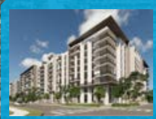
THE GARDENS RESIDENCES