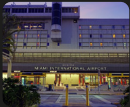
MIAMI INTERNATIONAL AIRPORT