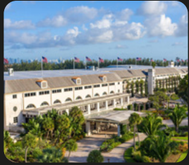
HIALEAH PARK CASINO