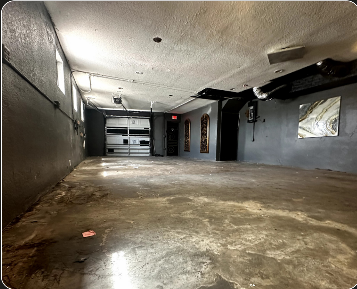
LEVEL 1 - SPACE 2