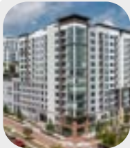
CAMDEN LAKE EOLA

225 S GARLAND AVE 234 RESIDENTIAL (In Construction)