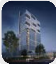
CHURCH ST PLAZA

225 S GARLAND AVE 234 RESIDENTIAL (In Construction)