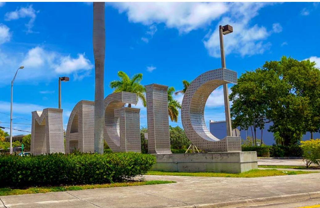
Magic City Innovation District